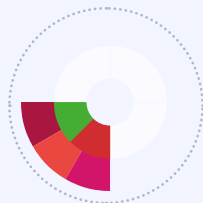
Social contribution Human capital +€17 billion