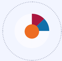
Economic contribution +€48 billion