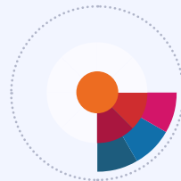
Social contribution Digital inclusion €32 billion